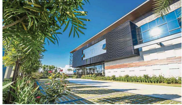
Lush greenery within the detached factory compound.