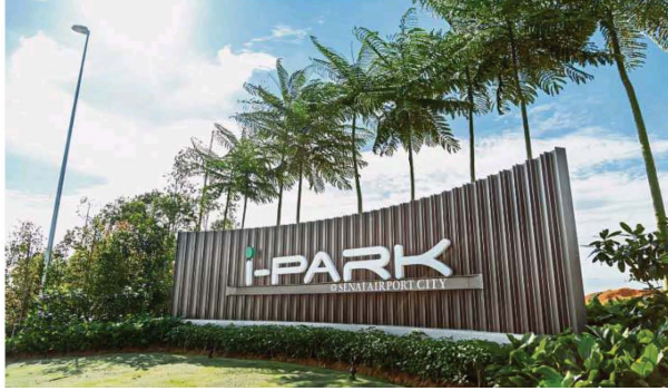
Welcome to i-Park@Senai Airport City.